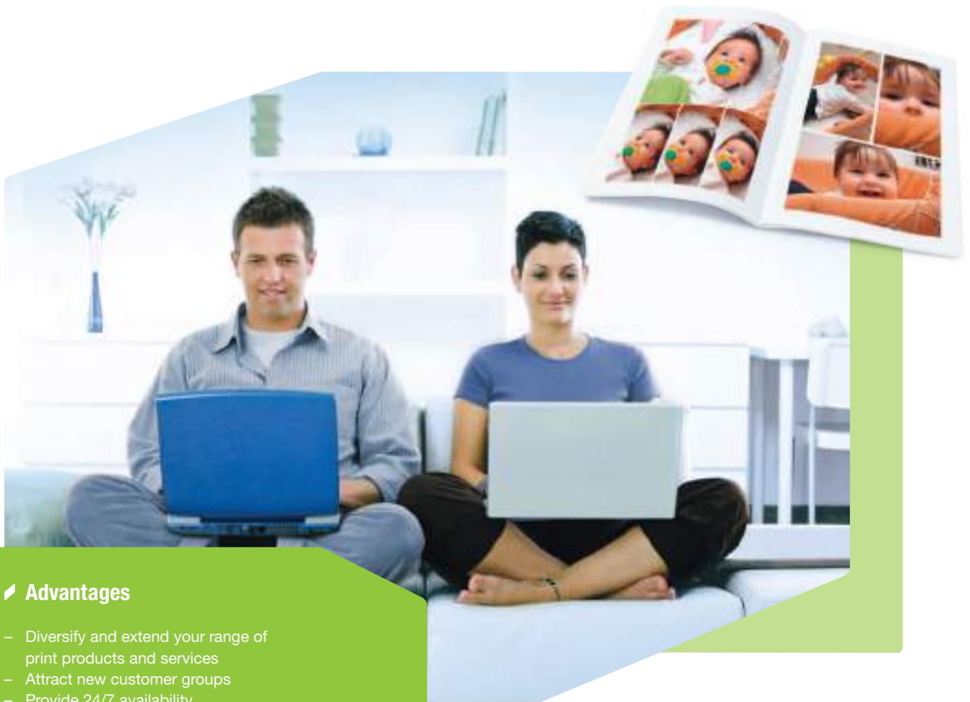
Photo book creation is an easy and attractive enhancement of your online print offering. Via a photo book application, you provide your customers with easy yet extensive online layout possibilities to create albums or calendars with their photos of holidays, events and other occasions. Similar to other web-to-print applications, photo book software includes online submission, payment and tracking, right down to the final delivery or collection of the printed photo book.

“Expand your services and grow your revenue.”